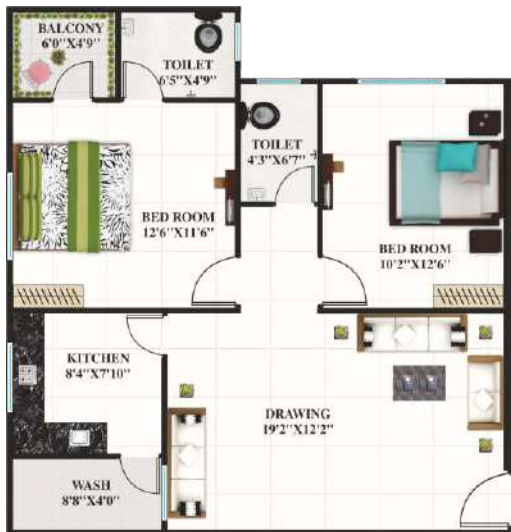
2BHK TYPE - C Super Built up Area - 1001 sq.ft.